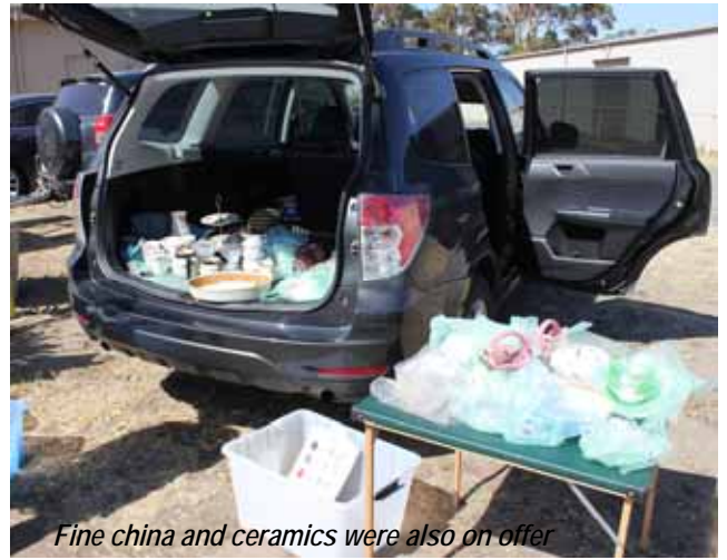
Fine china and ceramics were also on offer