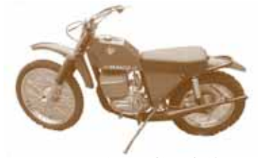
1973 Maico dirt bike