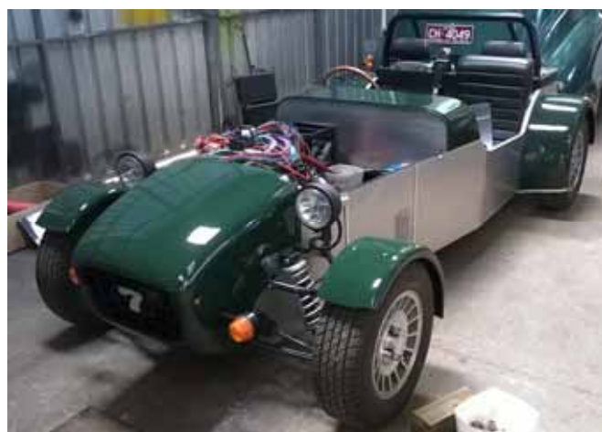
The Clubman Project is progressing well