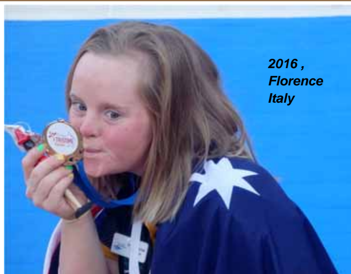
2016, Florence Italy

Down syndrome is the most common form of intellectual disability however those with Down syndrome have varying degrees of physical disabilities or impairments as well. So a swimmer with Down syndrome has to compete against able bodied athletes whose IQ was below 70. This means they have been outclassed and did not qualify for events like the Paralympics. Swimmers with Down syndrome could not compete on a level playing field, so could not enjoy the benefits experienced by able bodied athletes or those with a