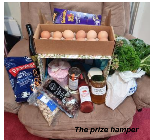
The prize hamper