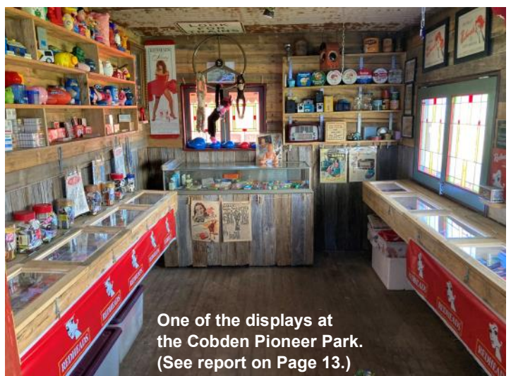
One of the displays at the Cobden Pioneer Park. (See report on Page 13.)