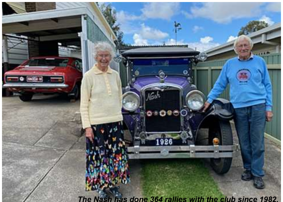
The Nash has done 364 rallies with the club since 1982.