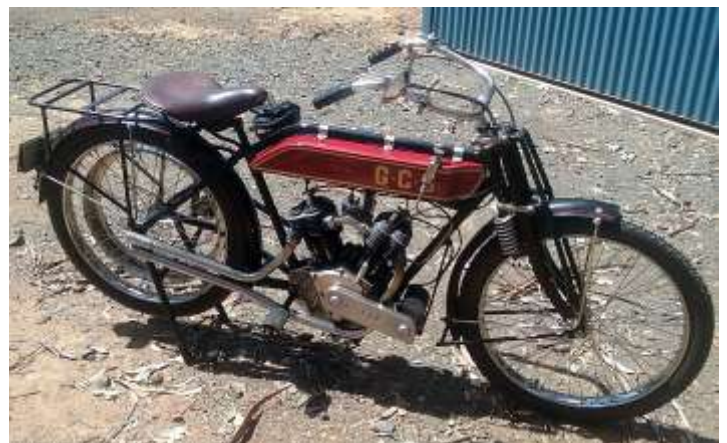
1914 GCS V-twin. Restored in Geelong, then SA. Purchased and moved to Victoria in 2018.