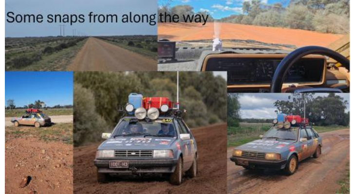
Some snaps from along the way

Among their challenges were a wearing gearbox. James explained: "We made it back (to Geelong) thanks to completing four gearbox fluid changes and one bottle of additive. We used three bottles of Chem-i-weld to seal our head gasket/cracked head. The Laser also suffered a few other problems. They used a ratchet strap to hold the front engine mount in and two foam gardening kneeling pads from Mitre 10 were stuffed into the back springs to hold the back end of the car up.