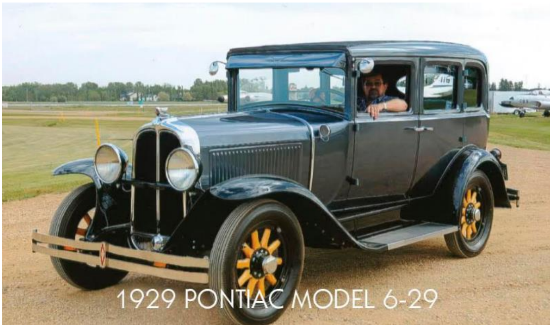
1929 PONTIAC MODEL 6-29