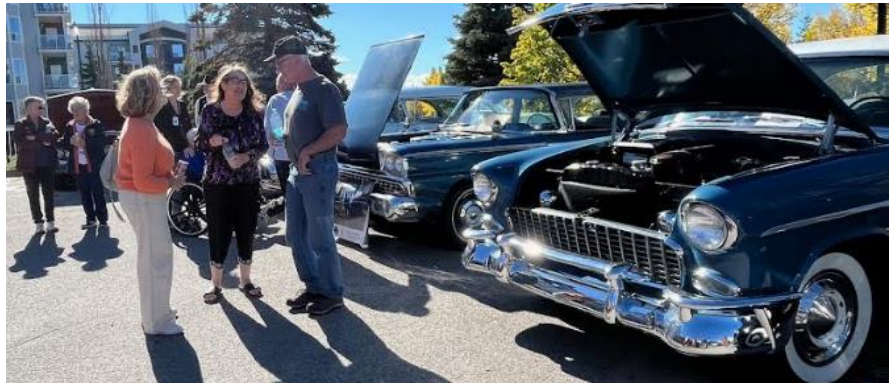
The Newfoundlanders sound great and will be included in some EACC 2025 functions. More great cars and great people.