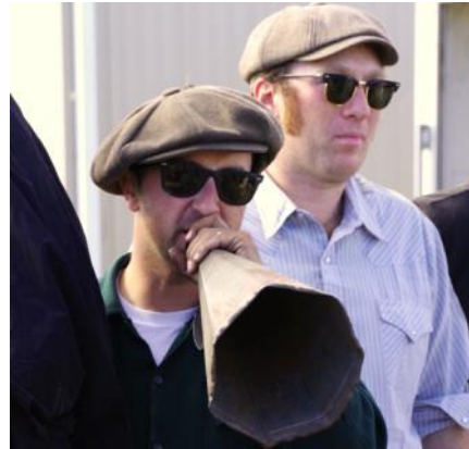
GENTLEMEN START YOUR ENGINES!