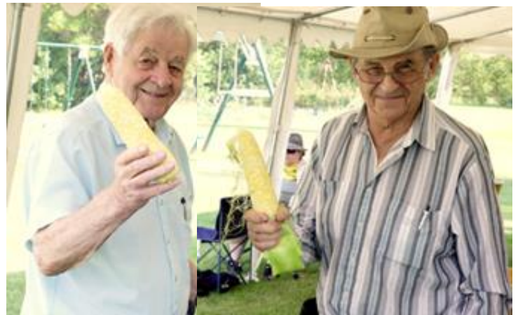
100 Candles requires a huff and a puff, helps to have a compressor ! The Dynamic Duo is at it again....What is the caption here ??