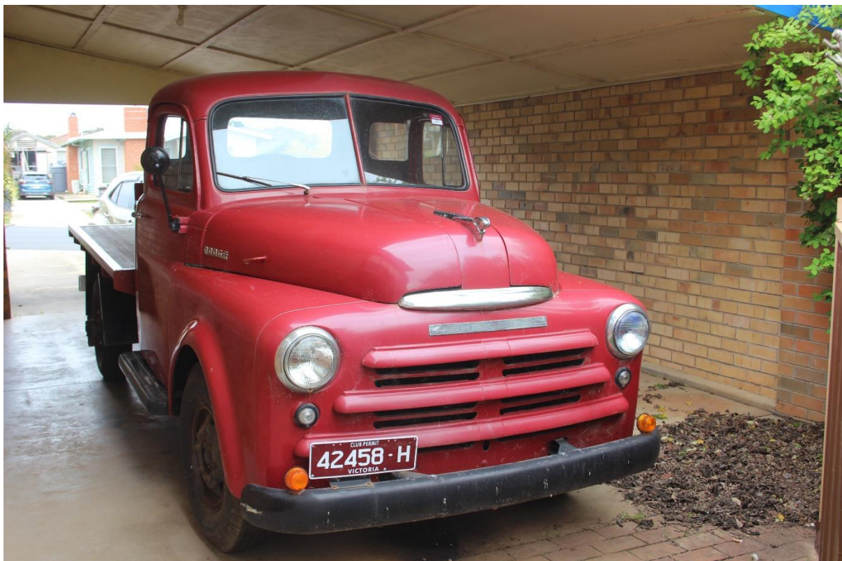
Ian Rogers' 1949 Dodge 25cwt truck