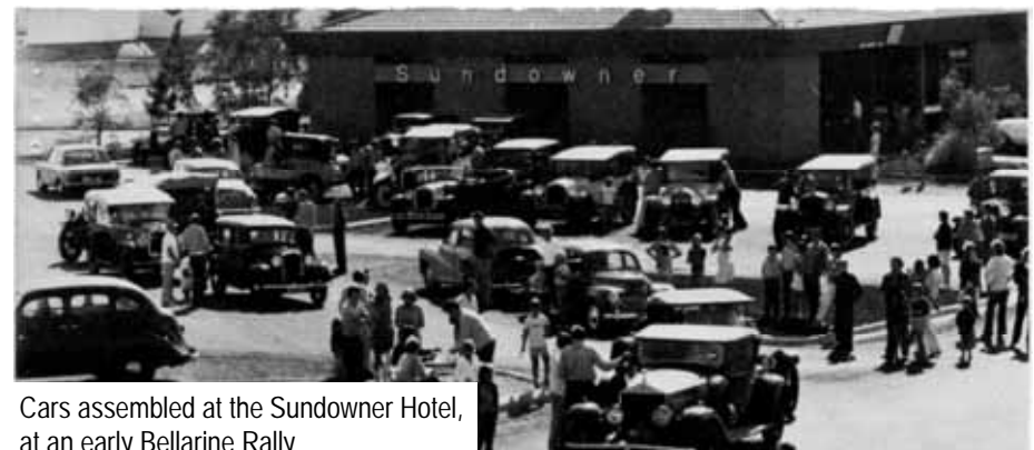
at an early Bellarine Rally (from the 10th Anniversary Backfire)

During the years that the "Bellarine" was held, we had an amazing variety of vehicles from many different clubs besides those of our own members.