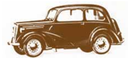
1939 Anglia 8 HP